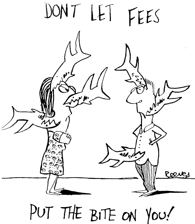
Anti-fees cartoon, circa 1988. Artist: Reeves

In the early 1990's CAPA produced a series of research reports into the plight of coursework students, the "Goodbye Rhyme and Reason" series. These reports were well received (see side bar, page 16), and went some way towards slowing the attack on coursework. Despite these attempts, up-front HECS fees were applied to an increasing number of coursework degrees, and the number of full-fee courses began to grow. When a new government took power in 1996, the battle against postgraduate coursework fees was comprehensively lost.