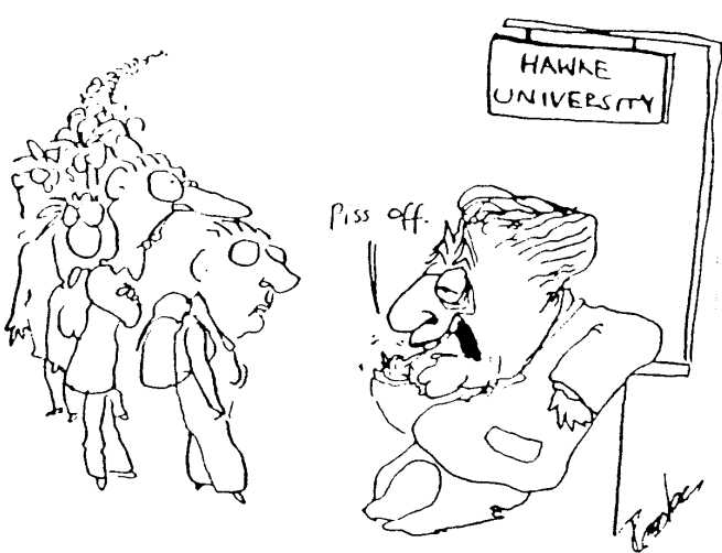
Cartoon on the Hawke Government and tertiary fees used in student campaigns, circa 1985. Artist unknown.

‘MPs urge students to fight fees proposal,’ The Age, 18 July 1985.