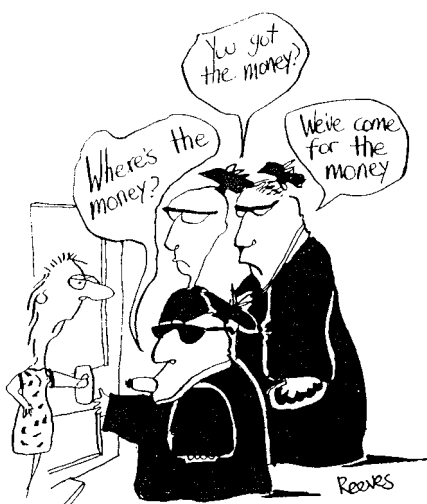
Cartoon used in anti-fees campaigns, circa 1985 – 1988. Artist: Reeves

The hated HEAC was defeated in 1988 – only to be replaced by HECS in 1989 as Dawkins set about unravelling then re-weaving the very fabric of Australian higher education.